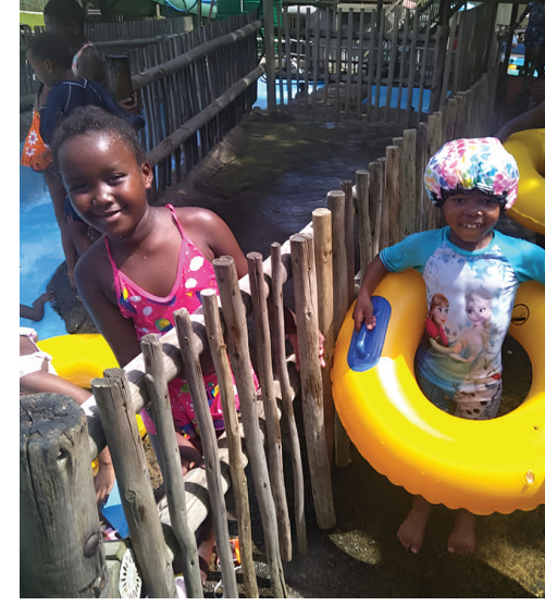
The foundation phase went first and the intermediate followed thereafter. The last trip was for the senior phase where the learners started off in a formal function at Amanzimtoti Civic Centre. They then proceeded to Splash where they first had scrumptious meals at Spur eatery and thereafter went for swimming.

The excursion allowed learners to enjoy child-friendly rides and splashing in the large swimming pools with the slides.