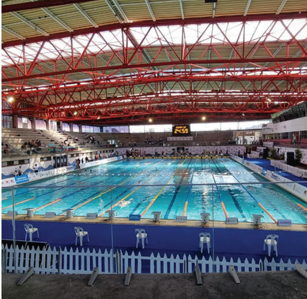
ABOVE: Windy Heights Primary School learners were part of the BRICS Games this year. EXTREME RIGHT: Learners were excited to rub shoulders with professional swimmers from across the globe.