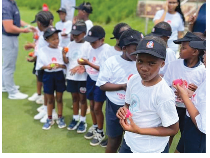
ABOVE LEFT: Learners being coached by one of the professional golf players. RIGHT: Learners warming up before a friendly game with another school.